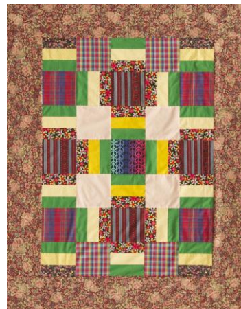
Different strips were used to create the fence rail blocks.