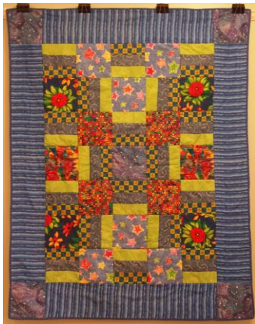
Corner blocks were added to the top and bottom borders.